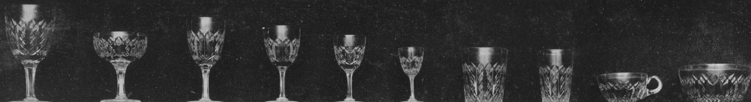
No. 2 Shape, Cut L Pattern.