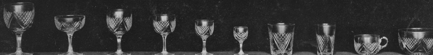
No. 3 Shape, Cut O Pattern.