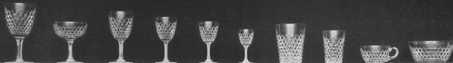
No. 2 Shape, Cut Hobnail Diamond, or C Pattern.