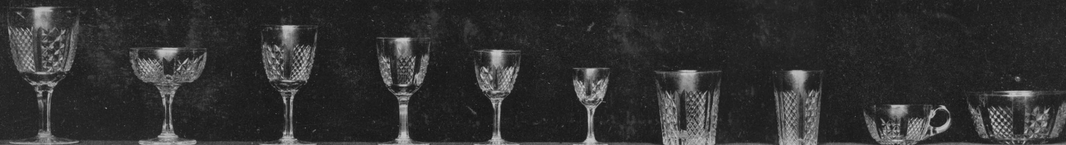
No. 2 Shape, Cut N Pattern.