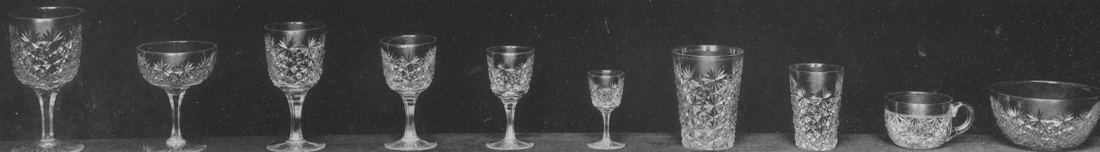
No. 1 Shape, Cut Russian, or E Pattern.