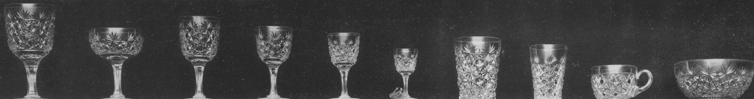
No. 1 Shape, Cut Hob and Star, or D Pattern.