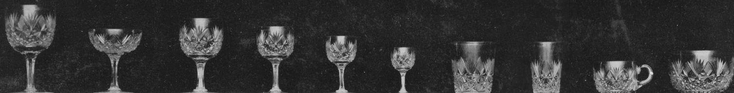
No. 3 Shape, Cut M Pattern.