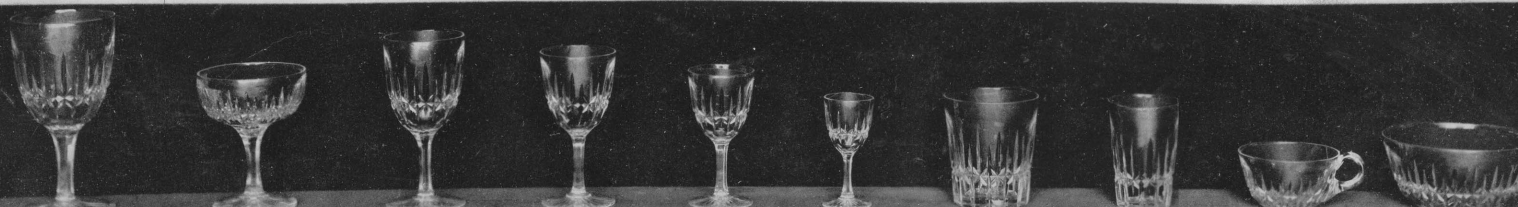
No. 2 Shape, Cut P Pattern.