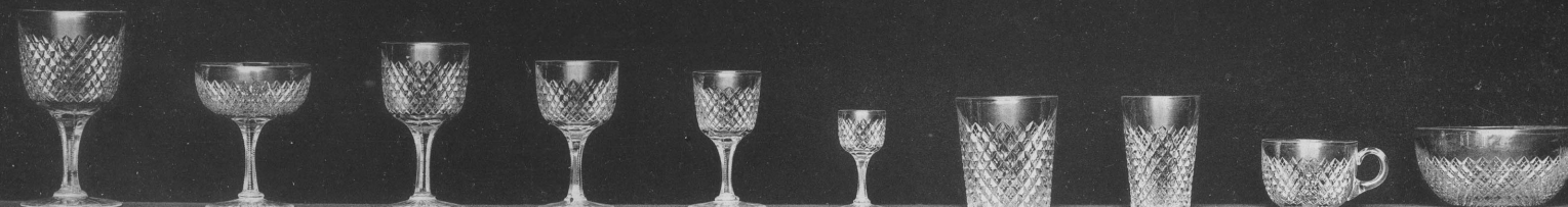
No. 1 Shape, Cut Strawberry Diamond, or A Pattern.