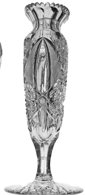
Two views of a pedestal ovoid vase cut in the Eleanor pattern by J. Hoare. 3 1/4" long vesica tusks are cut onto each end.

Join the ACGA to receive monthly Hobstar issues. Members also have worldwide access to the wealth of cut glass knowledge in our growing library of online catalogs and online Hobstar archives, which present every issue published since 1978.