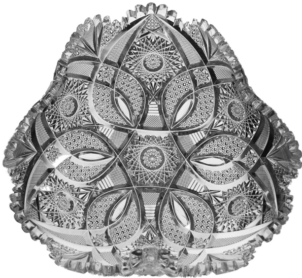
Triangular r Fancy Dish cut in the Duchess pattern by Pitkin & Brooks. 3" tall, 10" wide.

There are eighteen pictures of cut glass in this issue, plus several articles. Here are some of those pictures.