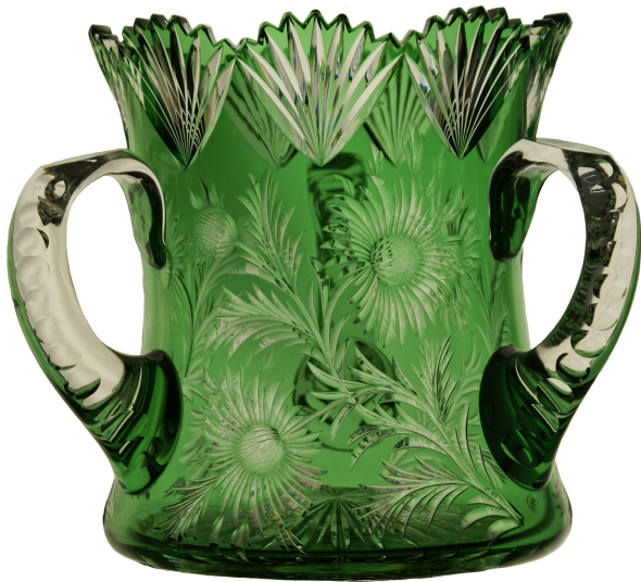
Corset form three handled loving cup green cut to clear in a "rock crystal" design, 7 3/4" tall, 7" rim. Rarities (160) shows a smaller example.

There are eighteen pictures of cut glass in this issue, plus several articles. Here are some of those pictures.