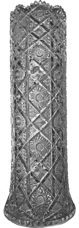
Umbrella stand cut in the Roman pattern by Kelly and Steinman. 25 1/2" tall, 7" rim, 23 1/2 lbs. Only two of these are believed to survive. See Rarities (251) and compare with Kelly & Steinman Catalog reprint (100-02)..