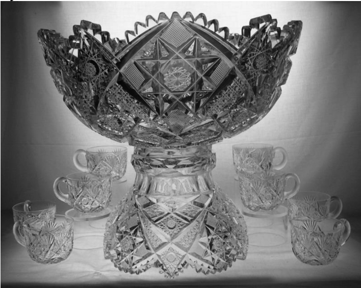
Phenomenal punch bowl with 8 matching cups. 14 1/4" diameter and 13" tall. Just in time for the holidays, some of almost three dozen pieces pictured and described for sale in a 3-page hobstar.com advertisement.

Just Published: two new books of immediate interest to those seeking to advance their knowledge regarding American Brilliant Era cut glass: