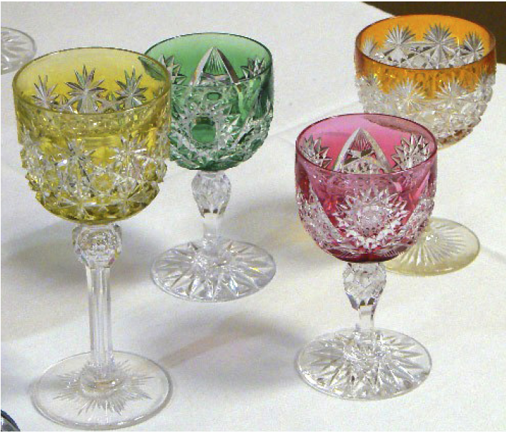
Four colored-cut-to-clear wines from the West Coast Fun & Learning Weekend , as described by Carrol Lyle.