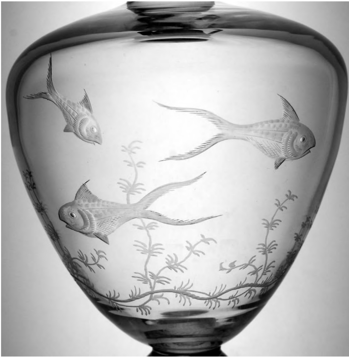
Font of a "water lamp," engraved by Hawkes.

Pictured: two green cut to clear bulbous colognes cut in a slight variation of the Marlboro pattern. Pictured: pattern detail of a punchbowl cut in a slight variation of Gladys pattern, cut and signed by Hawkes. Pattern variations might be motivated by the need to differ slightly from a high-volume pattern cut by a competitor, or by accommodation to a particular shape.