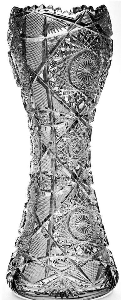
14" vase cut in the Elmira No. 33 pattern.

“Cover My Error: Hawkes Grecian & Hobnail Pattern” by Rob Smith The oval tray pictured on the Sept. 2015 Hobstar front cover probably is not Grecian and Hobnail by Hawkes. Grecian and Hobnail is a single reference pattern, but the 1888 patent drawing (below) clearly illustrates the pattern elements and arrangements.